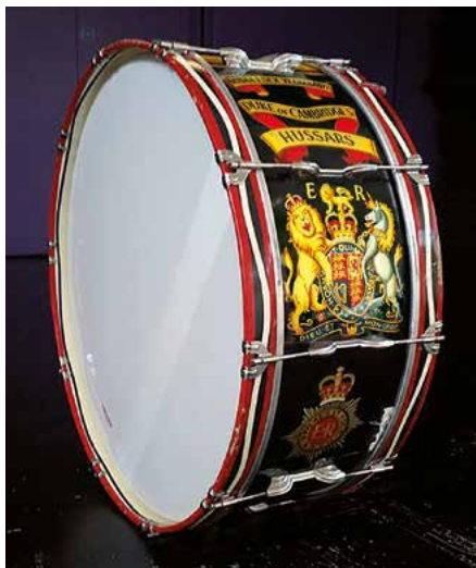
One of the Bass Drums belonging to Middlesex Yeomanry Hussars

THE MIDDLESEX YEOMANRY Concert Band is the band associated with the 47 (Middlesex Yeomanry) Signal Squadron of the British Territorial Army. Surviving several disbandments and reorganisations, the band's military roots can be traced back for over 150 years.