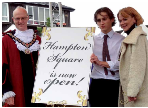
So that's what was under the curtain (see front cover)! The square is now officially open!

For the record, it's 33 years since the original "square outside Sainsburys" opened. At the time it was a victory for the Hampton Society, who campaigned for neighbourhood shops to be included in plans