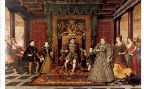
Family of Henry VIII, an Allegory of the Tudor Succession