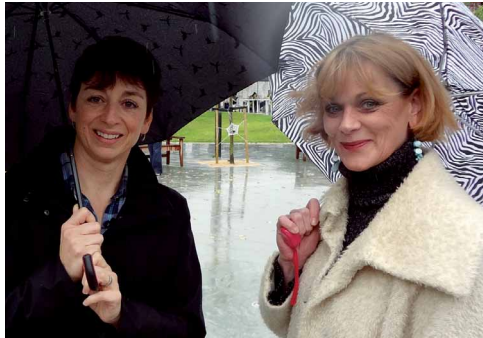
The two Samanthas at the opening of Hampton Square last month.

And finally, it was encouraging to see a good turn-out at the Hampton Square opening ceremony. How well the Sunday market fits into the scheme and breathes new life and