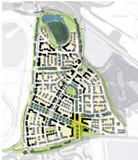
Above is a plan from 2014 showing an initial concept for the development at Kempton Park from a brief to architects competing to design the new suburb that the Jockey Club wants to build on this stretch of Green Belt.