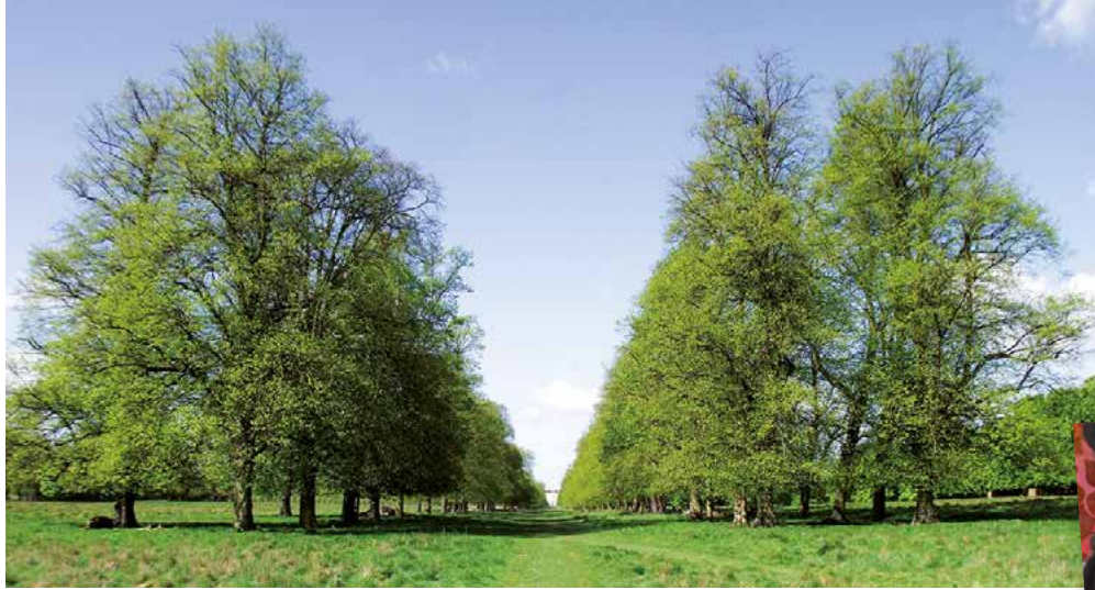
Lion Gate, Hampton Court, Friday 25 September at 10.00am