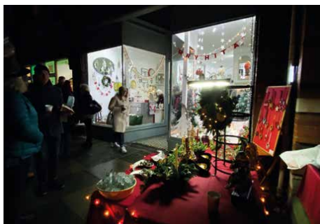
▲ Glorious gift shop