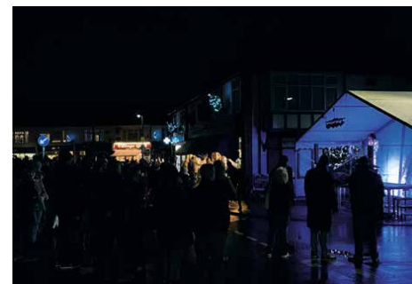
▲ Elvis was 'outside the building'!