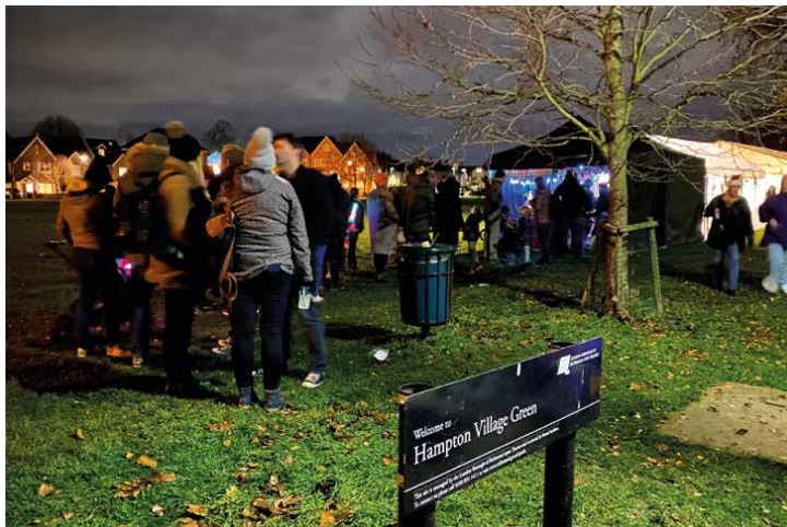
▲ As a safety precaution, Santa's Grotto became a well ventilated 'walk-through' on the green – the queue is twice as long as the one in the picture!