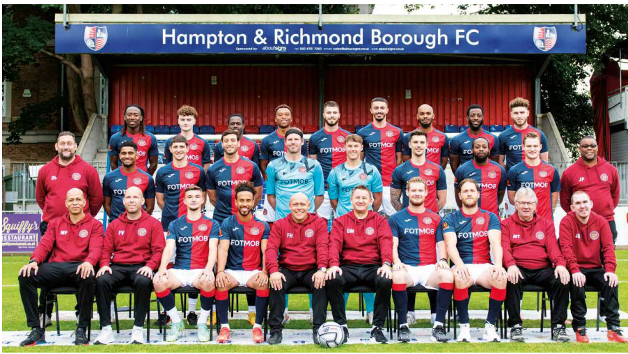
▲ The Hampton & Richmond Borough Football Club 2021-22 1st team