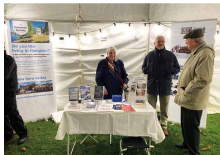
▲ The Hampton Society stand