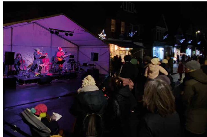
▲ Entertainment came from numerous acts on two music stages – one outside the Sea Scout hut and the other by Hampton Cellar ▼