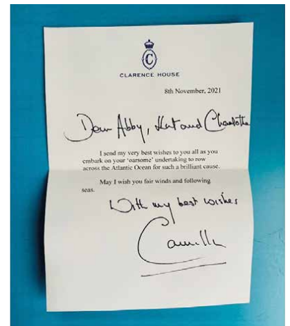
▲ A letter of support from Camilla, Duchess of Cornwall. ▼ And away...