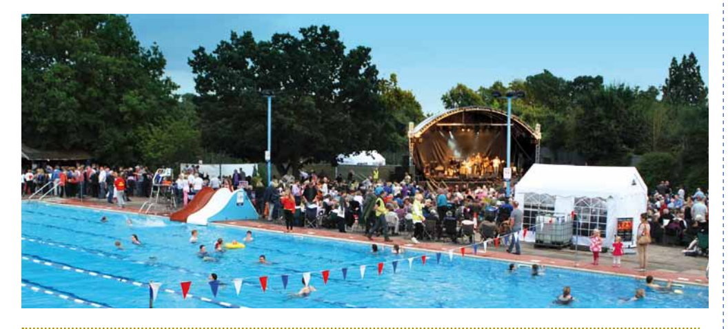
Tickets are available now at www.hamptonpool.co.uk

Any surplus made from the concert season goes toward safeguarding the future of Hampton Pool and developing the treasured facility. *