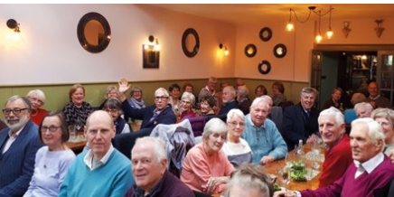
▲ Packed lunch at the Jolly Coopers

Whilst we will always maintain an eye on planning applications and continue to improve the channels of communication with members through this newsletter and regular emails, we will strive to build on the success of the talks and events we organise.