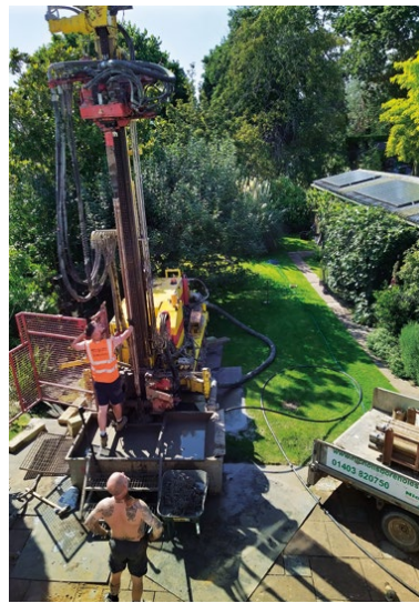
▲ Two 100 metre deep boreholes were drilled and a 1 metre deep trench dug the length of the garden in 2021

If you are considering a similar change of energy source, why not contact Tim at tim_lester@deftech.co.uk ? Thanks to Tim Lester for the account. MW