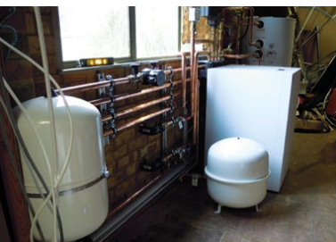
▲ The heat pump, the size of a domestic dishwasher, has been installed along with the ancillaries in Tim’s garage

Alongside work to dig a trench in the back garden, further insulation needed to be installed – 100mm of stone wool insulation under the suspended floors and between ground and first floors, for instance. Secondary and double glazing followed, then bigger radiators because of the lower water circulating temperature.