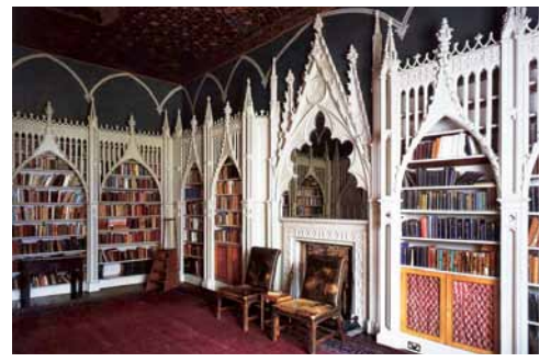
The shelves as they were (above), and how they can be seen are today (below).

They may yet be returned. A set of windows were returned from Farmington after being turned out by one of the priests occupying the Holbein room as a bedroom when Strawberry Hill House was part of St Mary's Teacher Training College. He said he found the originals draughty!